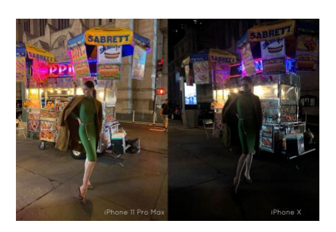
Night Mode, left. Without Night Mode, right

• Night Mode - Captures more detail and brightens your shots in low-light situations. The length of the exposure in Night mode is determined automatically, but you can experiment with the manual controls. Night Mode is enabled automatically.